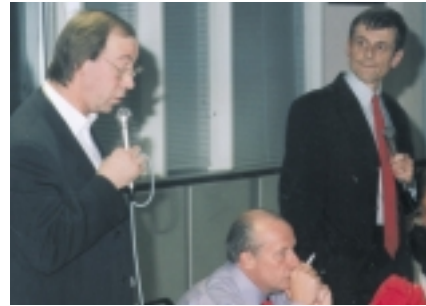
Arsenal legends at the AISA dinner

Attended by over 200 fans the first AISA Gala Dinner was a big success, thanks largely to the evening's guest speakers; Charlie George, Liam Brady, Sammy Nelson and Frank McLintock.